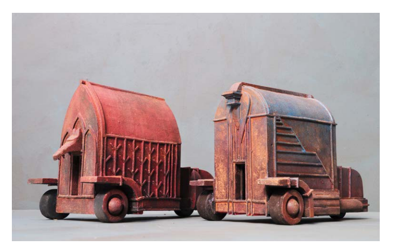
Stuart Elliott, Church & State, 2022, acrylic on wood, 20 x 45 x 28cm

In 2013 the seed of Art Collective WA came together through conversations between a number of artists,